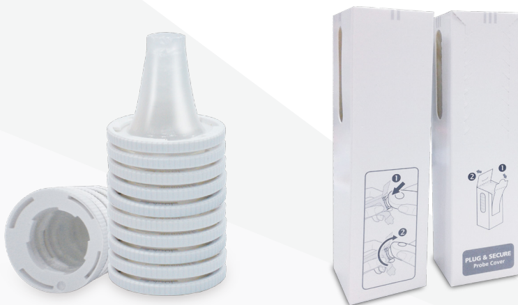
Ear probe box