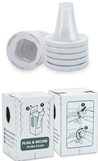
Ear probe box