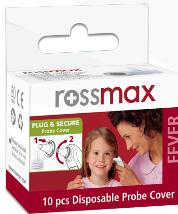
Small gift box